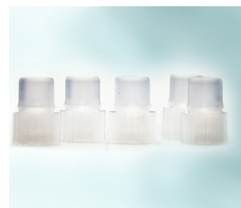
8 mm Plug Cap