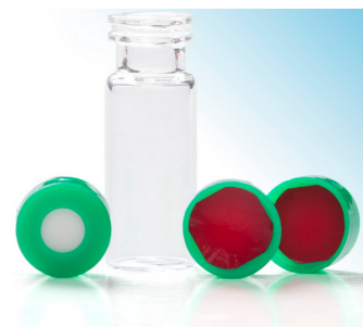
11 mm Snap Cap