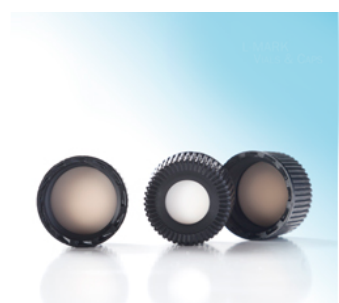
15-425 Screw Cap