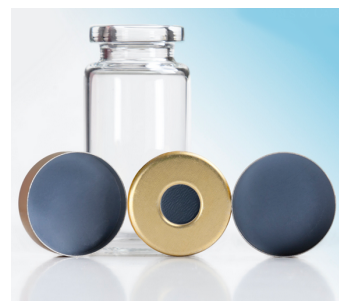
20 mm Crimp Cap