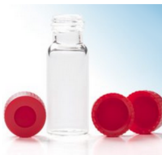
9 mm Screw Cap