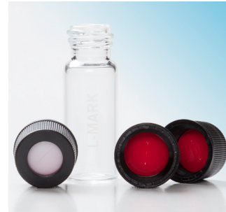
10-425 mm Screw Cap