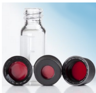
8 mm Screw Cap