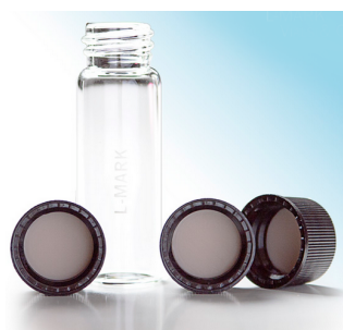
13-425 Screw Cap