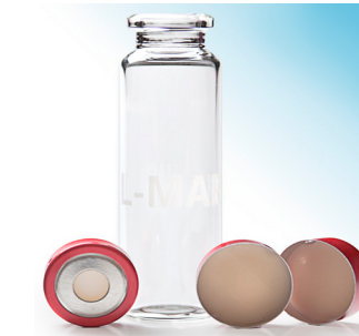
20 mm Crimp Cap (bi-metal)