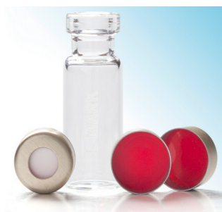
11 mm Crimp Cap