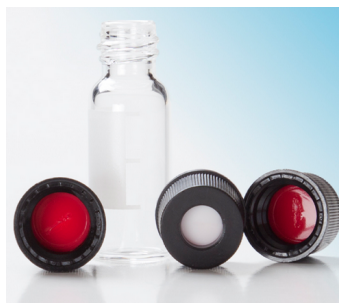
8-425 Screw Cap